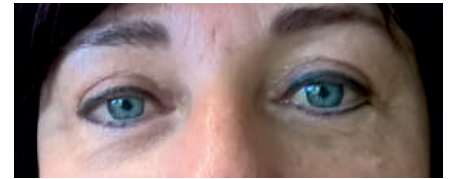
after 3 months