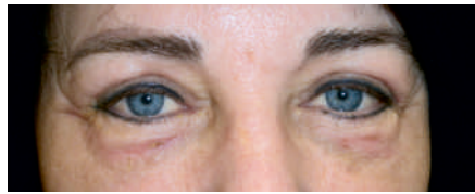
after 10 days